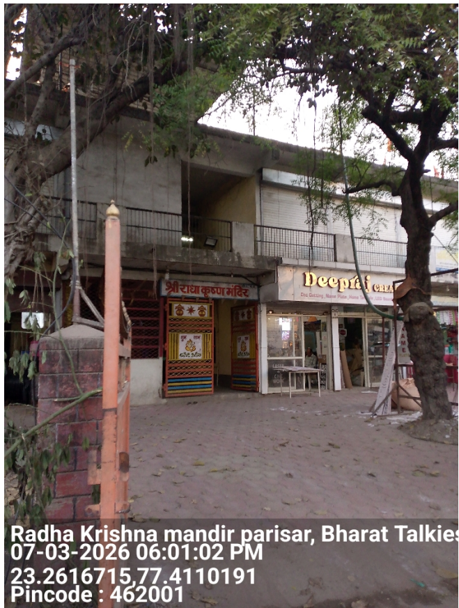
Radha Krishna mandir parisar, Bharat Talkies 07-03-2026 06:01:02 PM 23.2616715,77.4110191 Pincode : 462001

Shop front photo with full vertical viewpoint i.e; shop board, sealing, entrance, ground on which the shop is established (cemented, pilers, bricks, stands, mud, wheels etc.)