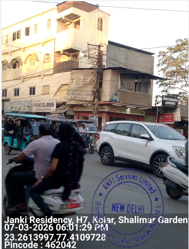
Janki Residency, H7, Kolar, Shalimar Garden 07-03-2026 06:01:29 PM 23.2613997,77.4109728 Pincode : 462042