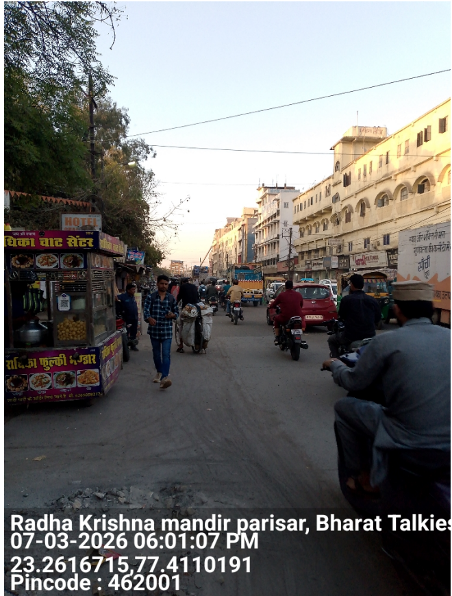
Radha Krishna mandir parisar, Bharat Talkies 07-03-2026 06:01:07 PM 23.2616715,77.4110191 Pincode : 462001

Shop inside with inventory photos establishing that the inside is of the same shop where the front photo was taken