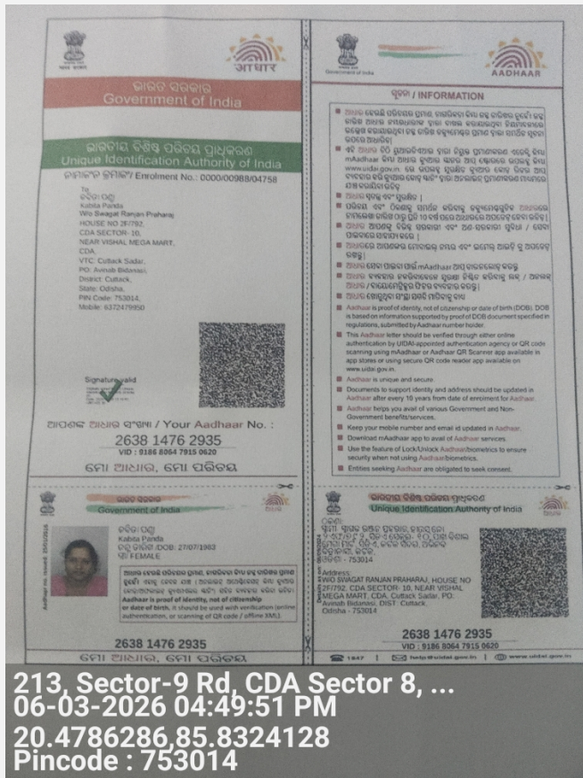
Photo of ID Proof