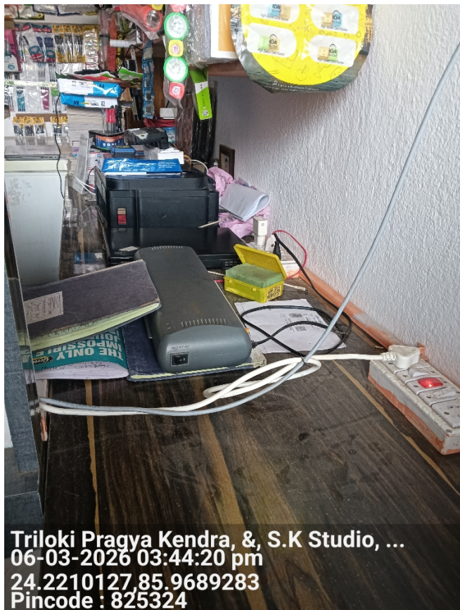
Photo of Machinery Setup