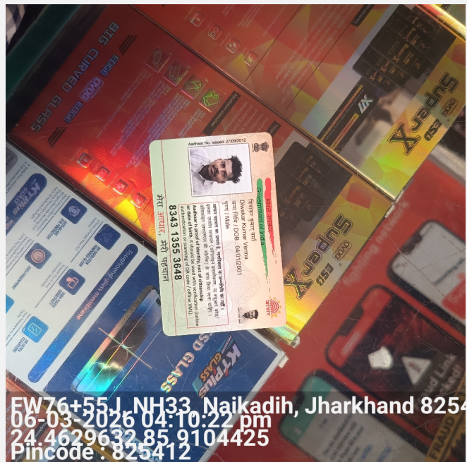
Photo of ID Proof