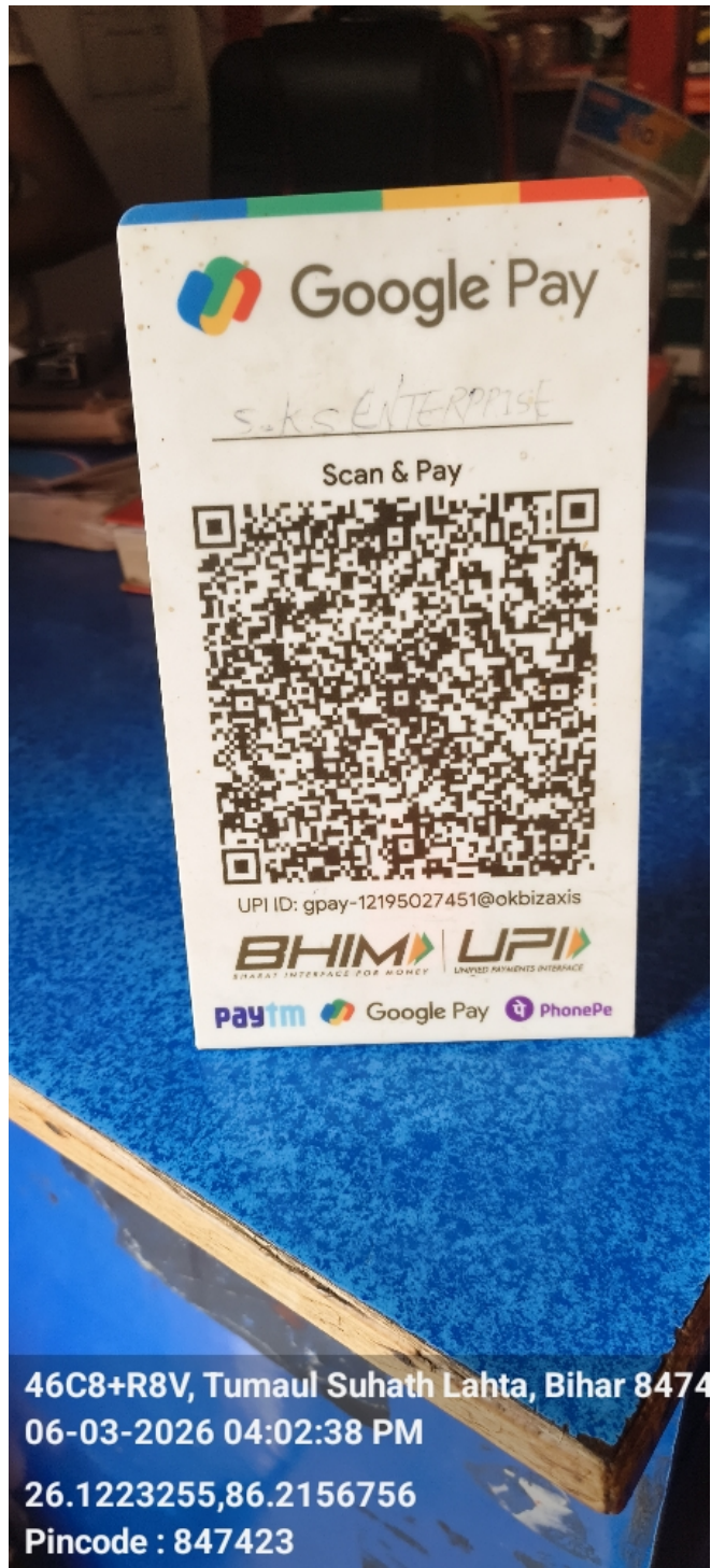
Photo with UPI Scanner