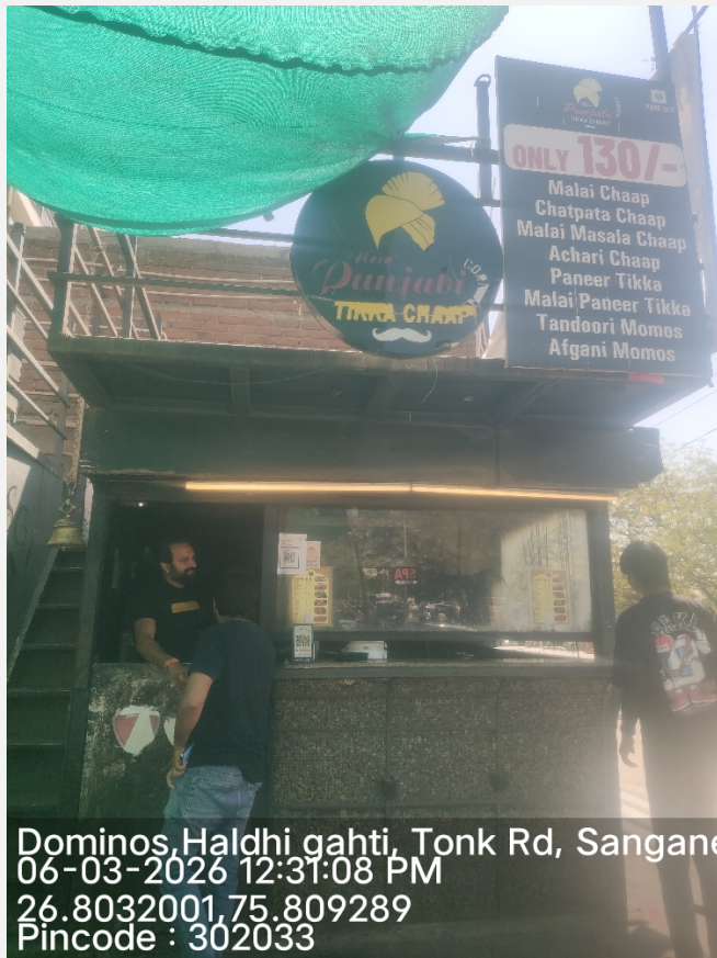
Dominos, Haldhi gahti, Tonk Rd, Sangane 06-03-2026 12:31:08 PM 26.8032001,75.809289 Pincode : 302033

Shop front photo with full vertical viewpoint i.e; shop board, sealing, entrance, ground on which the shop is established (cemented, pilers, bricks, stands, mud, wheels etc.)