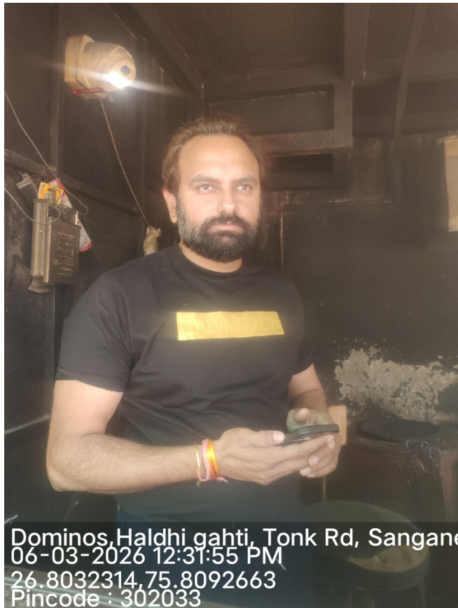
Dominos, Haldhi gahti, Tonk Rd, Sangane 06-03-2026 12:31:55 PM 26.8032314,75.8092663 Pincode : 302033

Take Photo of Person Met Inside the Shop