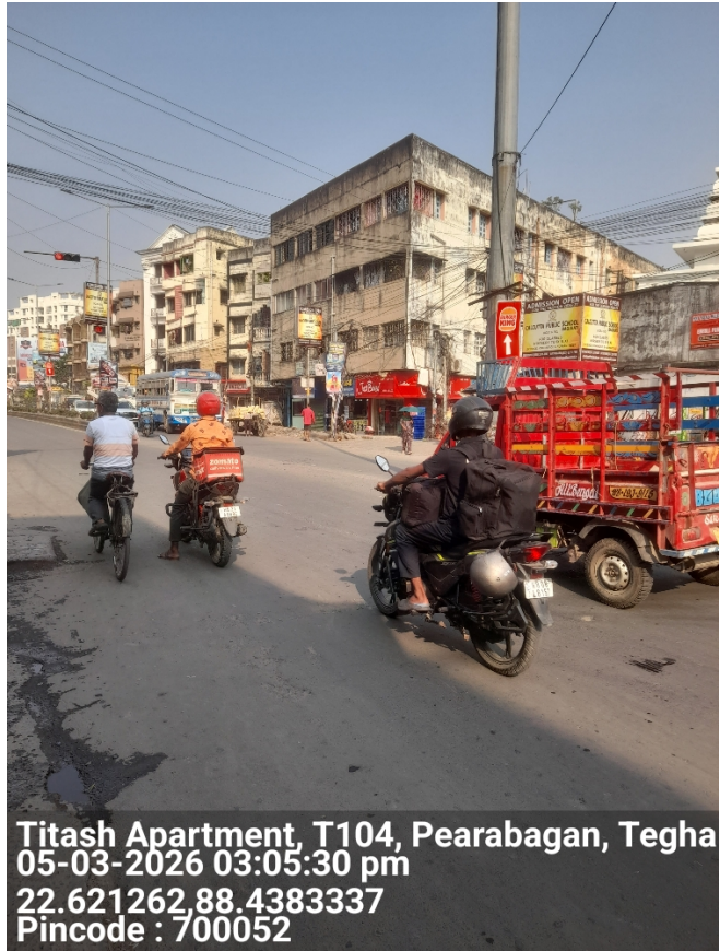
Titash Apartment, T104, Pearabagan, Tegha 05-03-2026 03:05:30 pm 22.621262,88.4383337 Pincode : 700052

Shop inside with inventory photos establishing that the inside is of the same shop where the front photo was taken