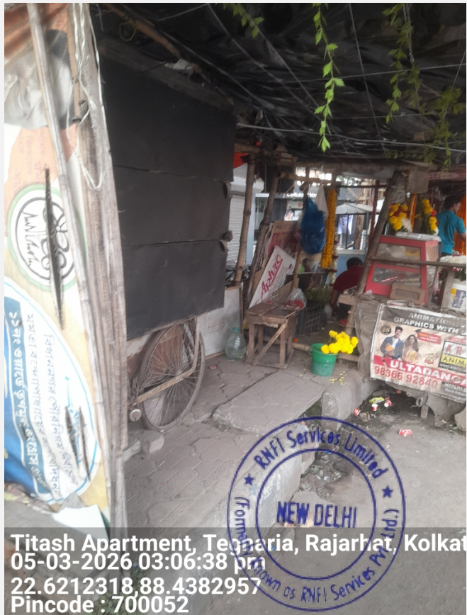
Titash Apartment, Tegharia, Rajarhat, Kolkata 05-03-2026 03:06:38 pm 22.6212318,88.4382957 Pincode : 700052