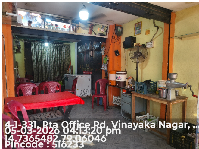
Photo of Machinery Setup