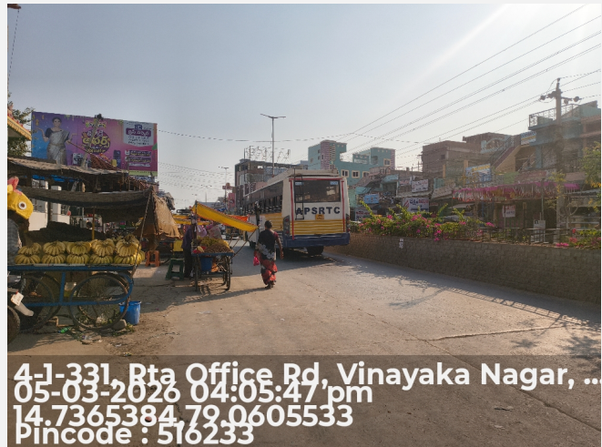
Photo of Outside Shop