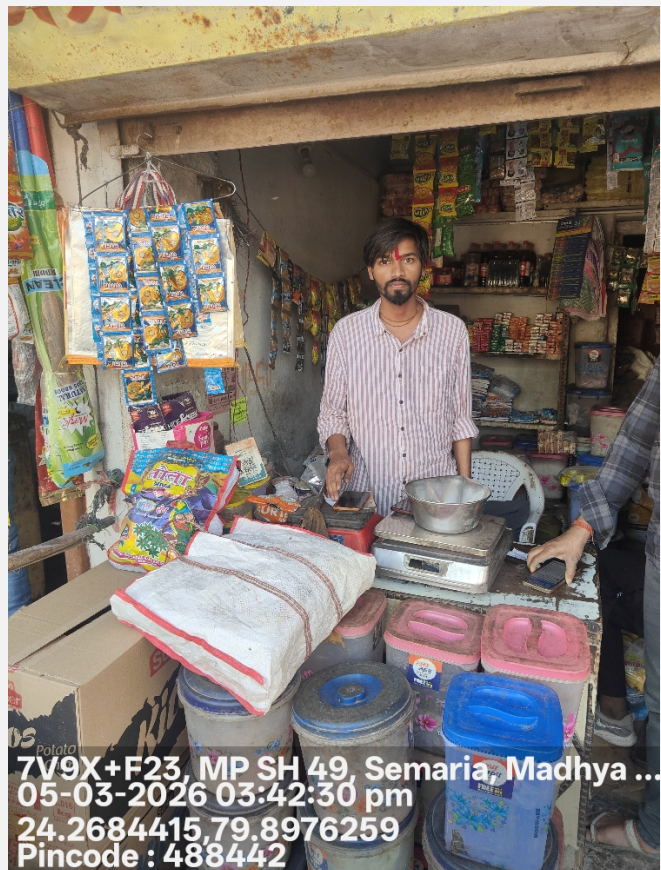
Shop Photo Outside