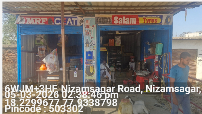
Shop Photo Outside