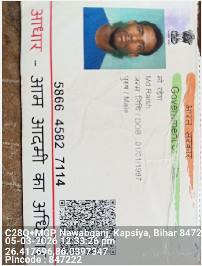
Photo of ID Proof