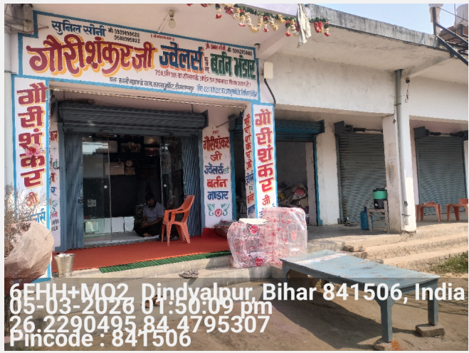
Photo of Outside Shop