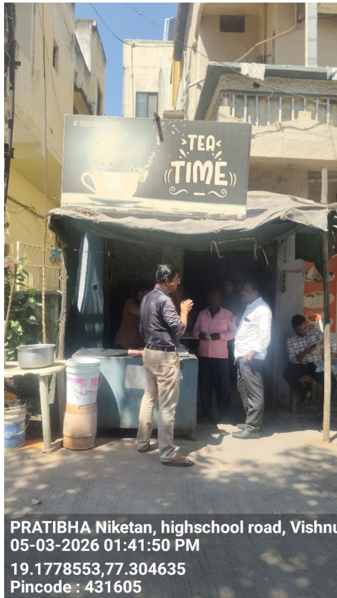
PRATIBHA Niketan, highschool road, Vishnu 05-03-2026 01:41:50 PM 19.1778553,77.304635 Pincode : 431605

Shop front with horizontal view covering the left & right of the shop establishing if the shop is an individual structure, in a marketplace, highway, isolated place, in a cluster framework.