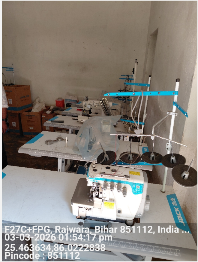
Photo of Stock