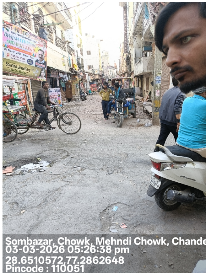
Sombazar, Chowk, Mehndi Chowk, Chandernagore 03-03-2026 05:26:38 pm 28.6510572,77.2862648 Pincode : 110051

Take Photo of Person Met Inside the Shop