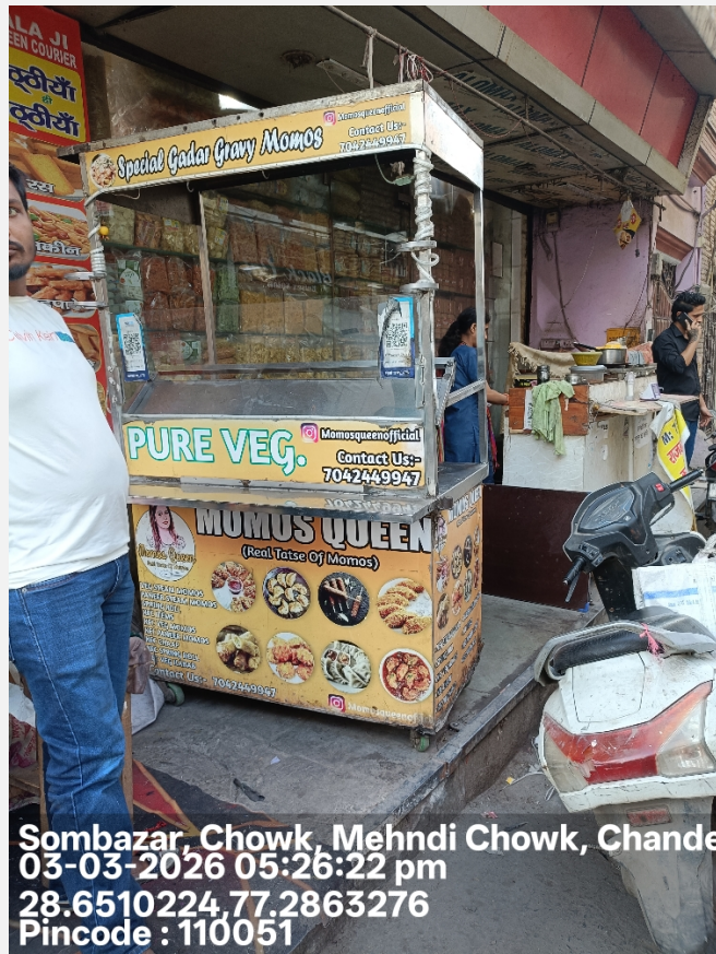
Sombazar, Chowk, Mehndi Chowk, Chandernagore 03-03-2026 05:26:22 pm 28.6510224,77.2863276 Pincode : 110051

Shop front photo with full vertical viewpoint i.e; shop board, sealing, entrance, ground on which the shop is established (cemented, pilers, bricks, stands, mud, wheels etc.)