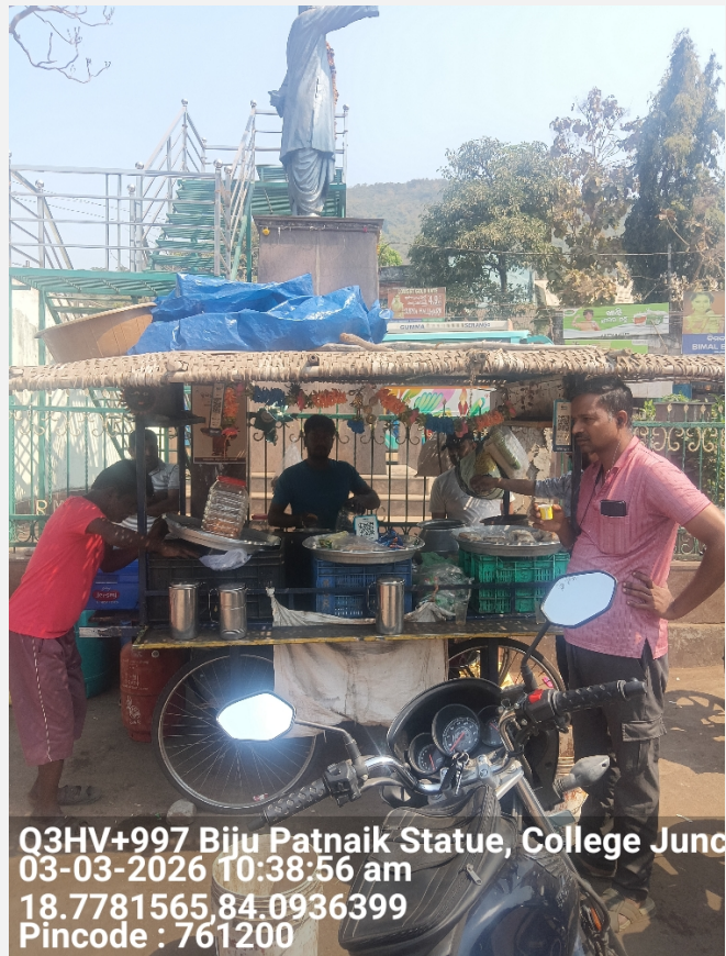
Q3HV+997 Biju Patnaik Statue, College Junc 03-03-2026 10:38:56 am 18.7781565,84.0936399 Pincode : 761200

Shop front with horizontal view covering the left & right of the shop establishing if the shop is an individual structure, in a marketplace, highway, isolated place, in a cluster framework.