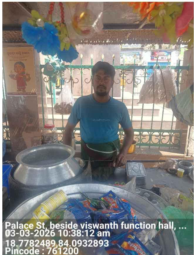
Palace St, beside viswanth function hall, ... 03-03-2026 10:38:12 am 18.7782489,84.0932893 Pincode : 761200

Shop inside with inventory photos establishing that the inside is of the same shop where the front photo was taken