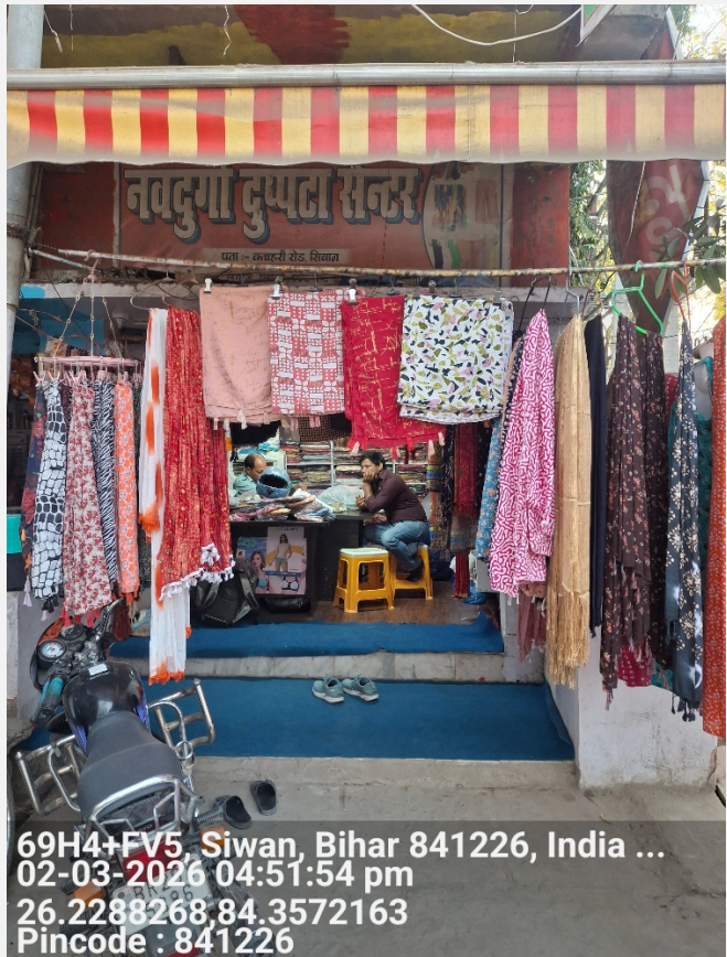
Shop Photo Outside