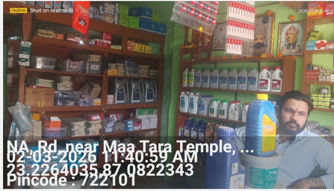
Photo of Stock

NA, Rd, near Maa Tara Temple, ... 02-03-2026 11:40:59 AM 23.2264035,87.0822343 Pincode : 722101