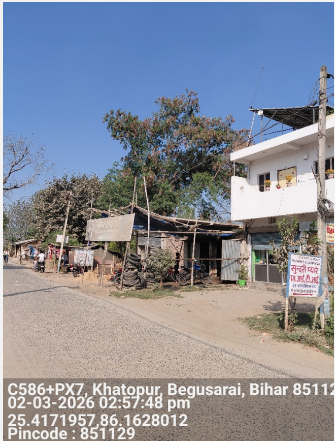
Photo of Stock