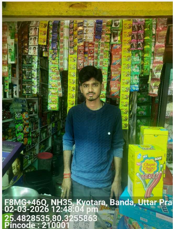
Photo of Stock