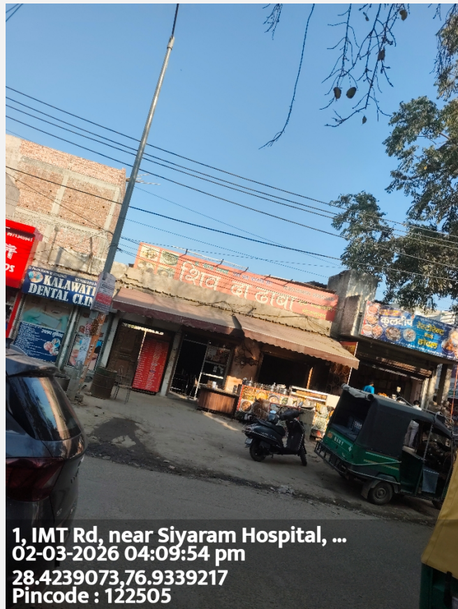
1, IMT Rd, near Siyaram Hospital, ... 02-03-2026 04:09:54 pm 28.4239073,76.9339217 Pincode : 122505

Shop front with horizontal view covering the left & right of the shop establishing if the shop is an individual structure, in a marketplace, highway, isolated place, in a cluster framework.