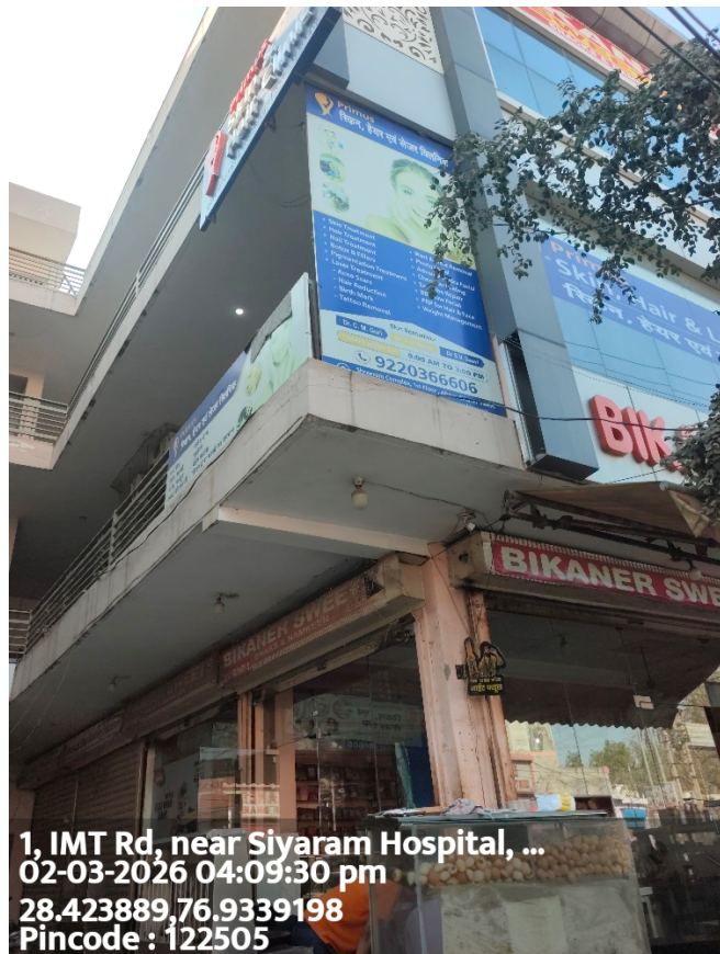
1, IMT Rd, near Siyaram Hospital, ... 02-03-2026 04:09:30 pm 28.423889,76.9339198 Pincode : 122505

Shop inside with inventory photos establishing that the inside is of the same shop where the front photo was taken