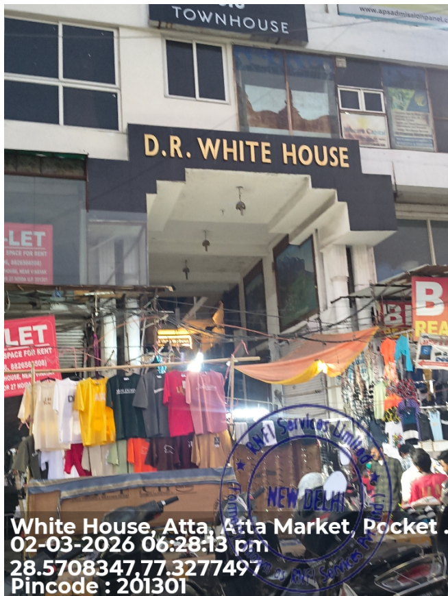
White House, Atta, Atta Market, Pocket . 02-03-2026 06:28:13 pm 28.5708347,77.3277497 Pincode : 201301