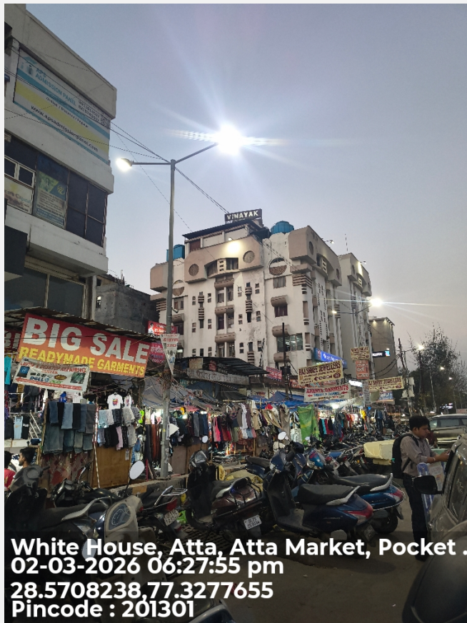
White House, Atta, Atta Market, Pocket . 02-03-2026 06:27:55 pm 28.5708238,77.3277655 Pincode : 201301

Shop inside with inventory photos establishing that the inside is of the same shop where the front photo was taken