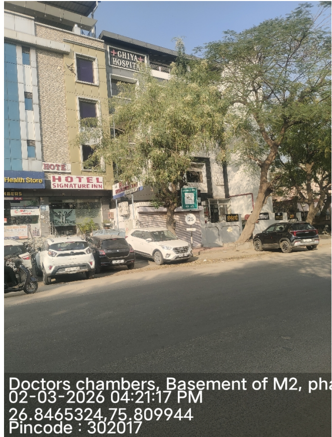
Doctors chambers, Basement of M2, ph 02-03-2026 04:21:17 PM 26.8465324,75.809944 Pincode : 302017

Shop front with horizontal view covering the left & right of the shop establishing if the shop is an individual structure, in a marketplace, highway, isolated place, in a cluster framework.