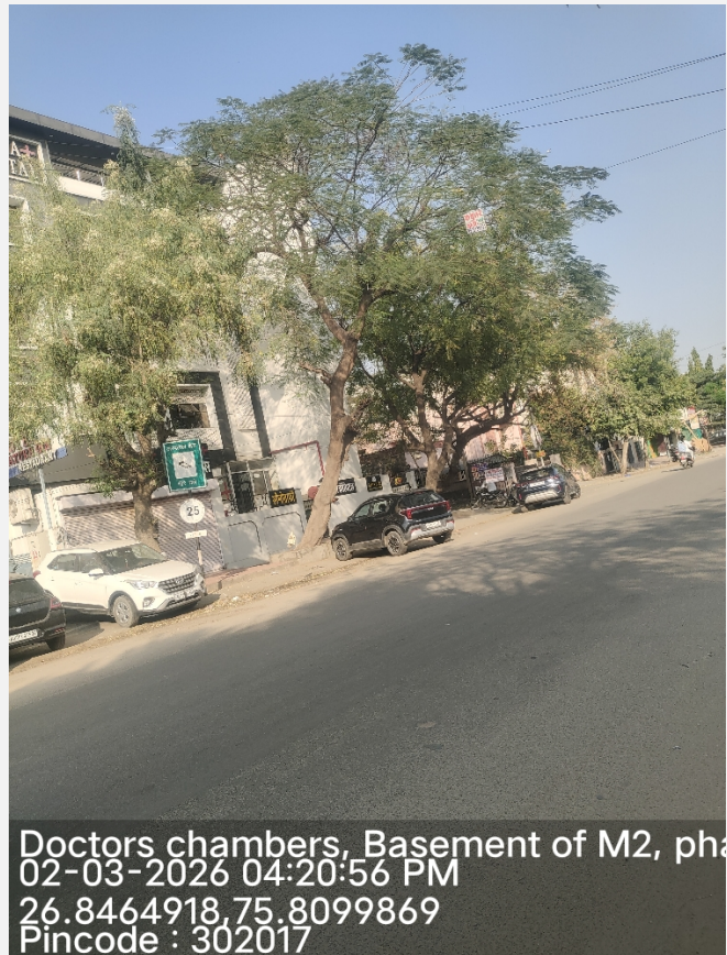
Doctors chambers, Basement of M2, ph 02-03-2026 04:20:56 PM 26.8464918,75.8099869 Pincode : 302017

Shop inside with inventory photos establishing that the inside is of the same shop where the front photo was taken