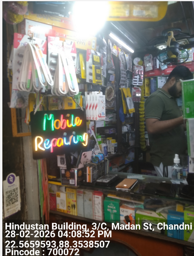
Hindustan Building, 3/C, Madan St, Chandni 28-02-2026 04:08:52 PM 22.5659593,88.3538507 Pincode : 700072

Shop inside with inventory photos establishing that the inside is of the same shop where the front photo was taken