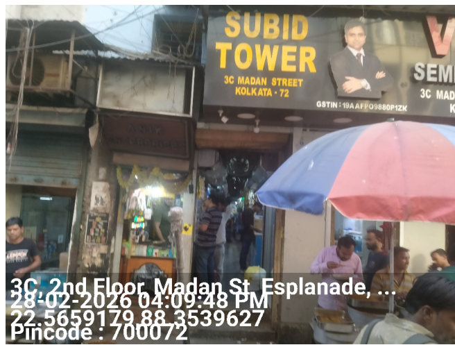
3C, 2nd Floor, Madan St, Esplanade, ... 28-02-2026 04:09:48 PM 22.5659179,88.3539627 Pincode : 700072

Shop front with horizontal view covering the left & right of the shop establishing if the shop is an individual structure, in a marketplace, highway, isolated place, in a cluster framework.