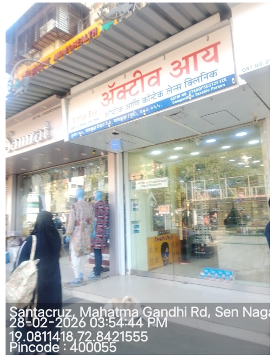
Santacruz, Mahatma Gandhi Rd, Sen Nagar 28-02-2026 03:54:44 PM 19.0811418, 72.8421555 Pincode : 400055