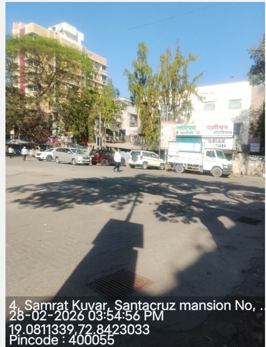
4, Samrat Kuar, Santacruz mansion No, . 28-02-2026 03:54:56 PM 19.0811339, 72.8423033 Pincode : 400055