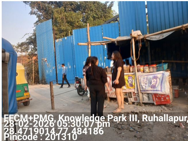
FECM+PMG, Knowledge Park III, Ruhallapur, 28-02-2026 05:30:07 pm 28.4719014,77.484186 Pincode : 201310

Shop inside with inventory photos establishing that the inside is of the same shop where the front photo was taken