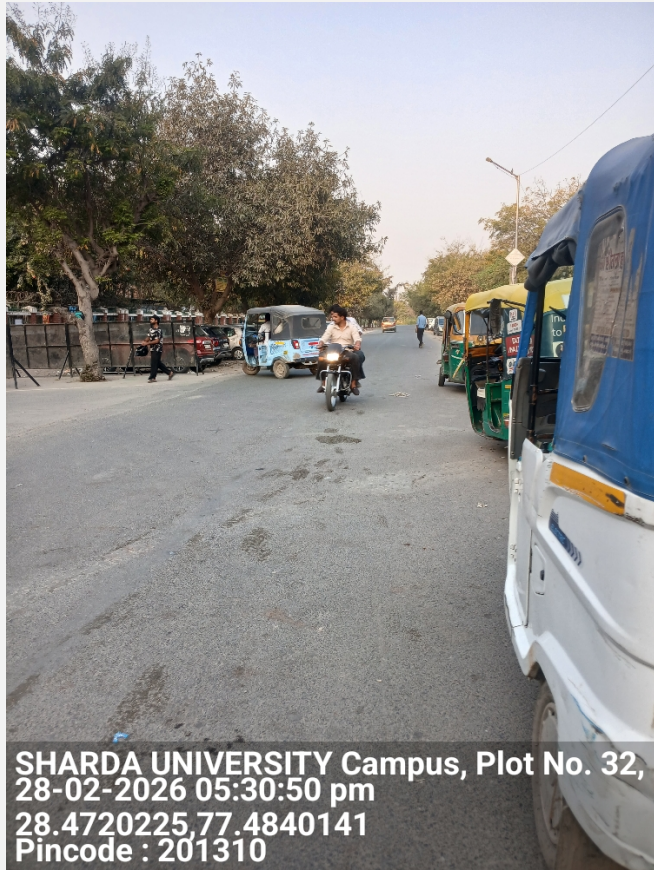
SHARDA UNIVERSITY Campus, Plot No. 32, 28-02-2026 05:30:50 pm 28.4720225,77.4840141 Pincode : 201310

Shop front with horizontal view covering the left & right of the shop establishing if the shop is an individual structure, in a marketplace, highway, isolated place, in a cluster framework.