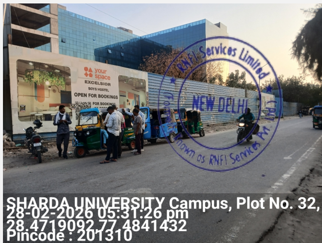
SHARDA UNIVERSITY Campus, Plot No. 32, 28-02-2026 05:31:26 pm 28.4719092,77.4841432 Pincode : 201310