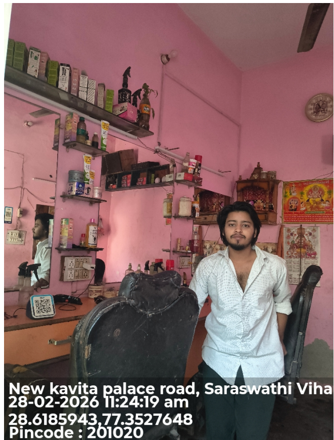
New kavita palace road, Saraswathi Viha 28-02-2026 11:24:19 am 28.6185943,77.3527648 Pincode : 201020

Take Photo of Person Met Inside the Shop