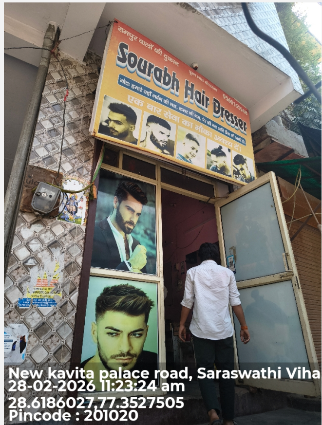
New kavita palace road, Saraswathi Viha 28-02-2026 11:23:24 am 28.6186027,77.3527505 Pincode : 201020

Shop front photo with full vertical viewpoint i.e; shop board, sealing, entrance, ground on which the shop is established (cemented, pilers, bricks, stands, mud, wheels etc.)