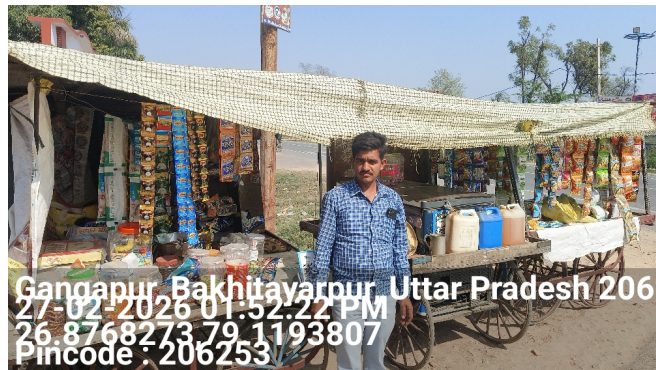
Gangapur, Bakhitayarpur, Uttar Pradesh 206 27-02-2026 01:52:22 PM 26.8768273,79.1193807 Pincode : 206253

Shop inside with inventory photos establishing that the inside is of the same shop where the front photo was taken