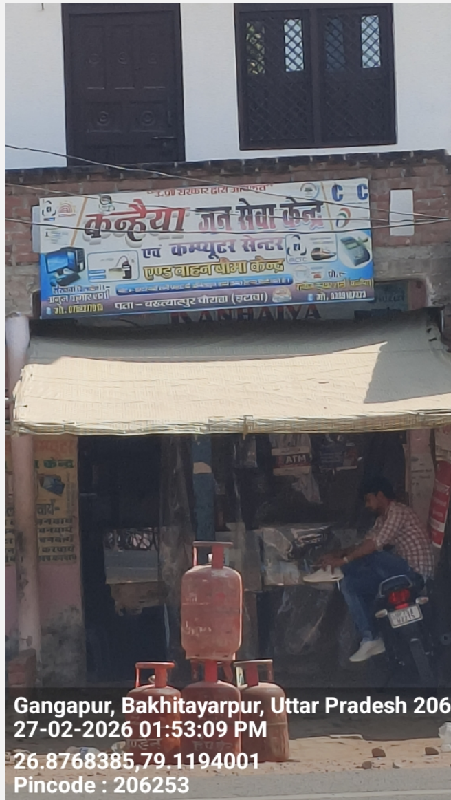
Gangapur, Bakhitayarpur, Uttar Pradesh 206 27-02-2026 01:53:09 PM 26.8768385,79.1194001 Pincode : 206253

Shop front with horizontal view covering the left & right of the shop establishing if the shop is an individual structure, in a marketplace, highway, isolated place, in a cluster framework.