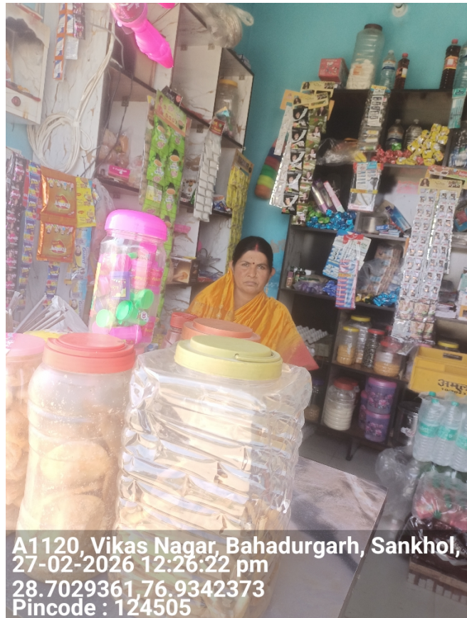
A1120, Vikas Nagar, Bahadurgarh, Sankhol, 27-02-2026 12:26:22 pm 28.7029361, 76.9342373 Pincode : 124505

Shop inside with inventory photos establishing that the inside is of the same shop where the front photo was taken