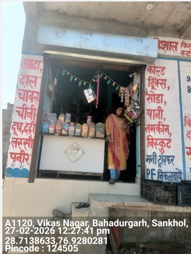
A1120, Vikas Nagar, Bahadurgarh, Sankhol, 27-02-2026 12:27:41 pm 28.7138633, 76.9280281 Pincode : 124505

Shop front with horizontal view covering the left & right of the shop establishing if the shop is an individual structure, in a marketplace, highway, isolated place, in a cluster framework.