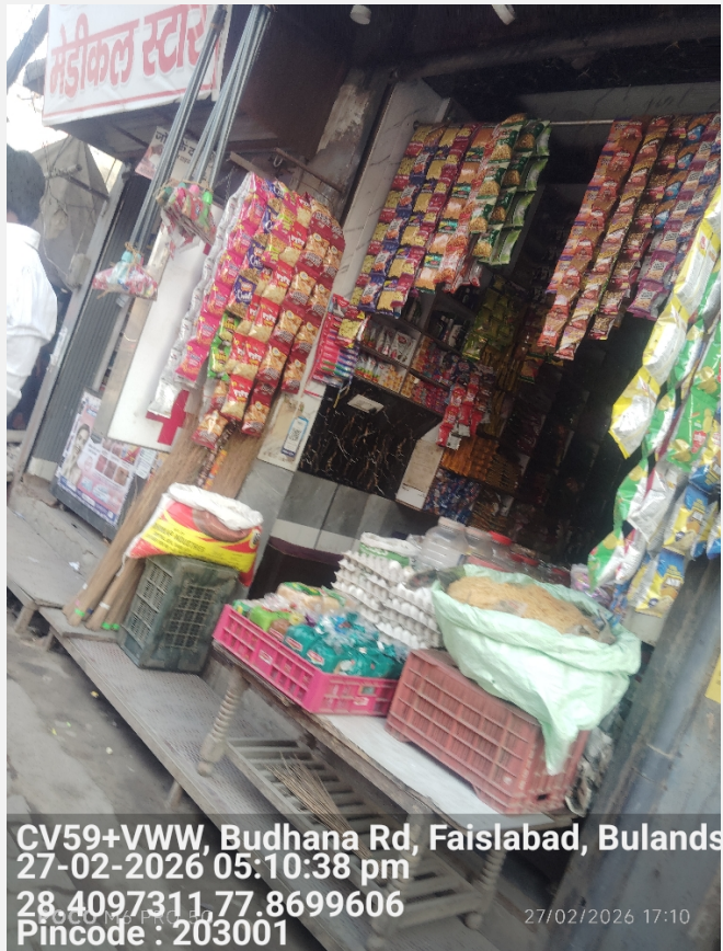
Shop Photo Outside