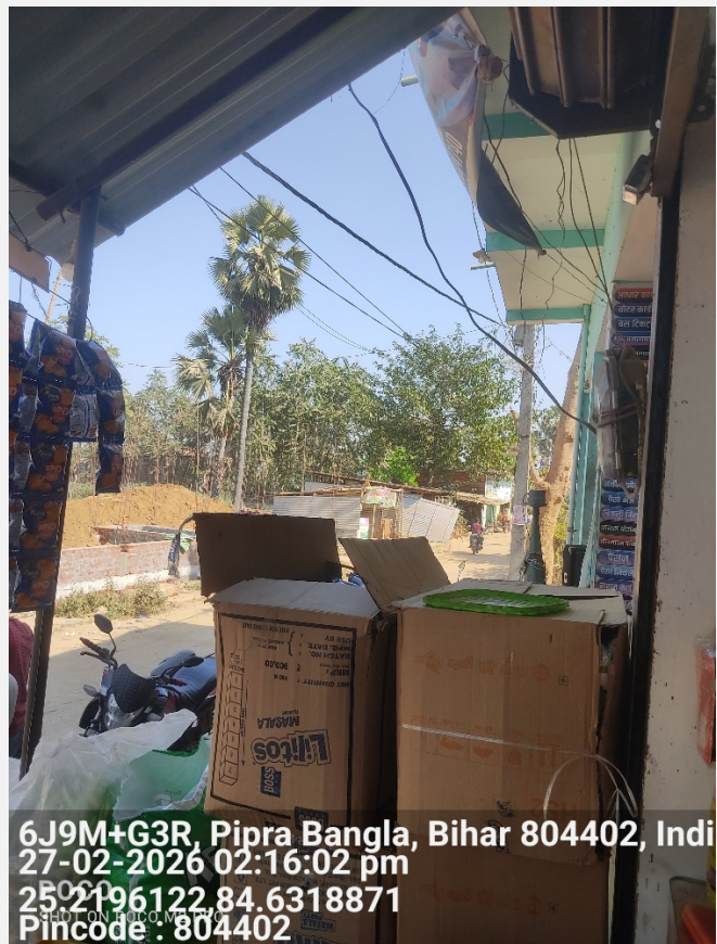
Shop Photo Outside