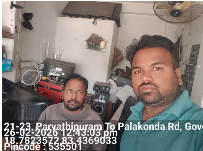
Photo with Agent