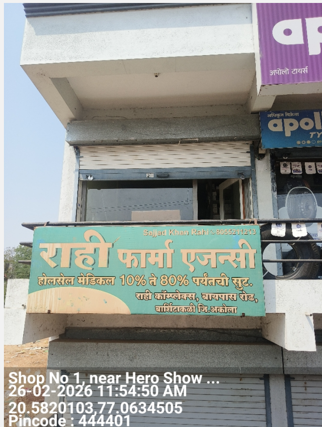
Shop No 1, near Hero Show ... 26-02-2026 11:54:50 AM 20.5820103,77.0634505 Pincode : 444401

Shop inside with inventory photos establishing that the inside is of the same shop where the front photo was taken