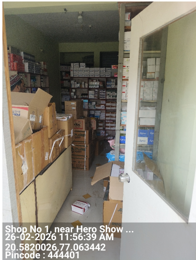
Shop No 1, near Hero Show ... 26-02-2026 11:56:39 AM 20.5820026,77.063442 Pincode : 444401

Shop front with horizontal view covering the left & right of the shop establishing if the shop is an individual structure, in a marketplace, highway, isolated place, in a cluster framework.