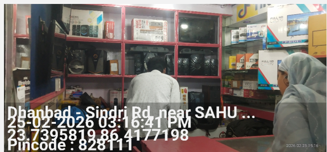
Shop Photo Outside