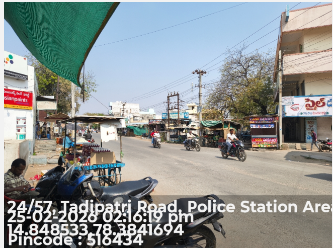
Photo of Outside Shop