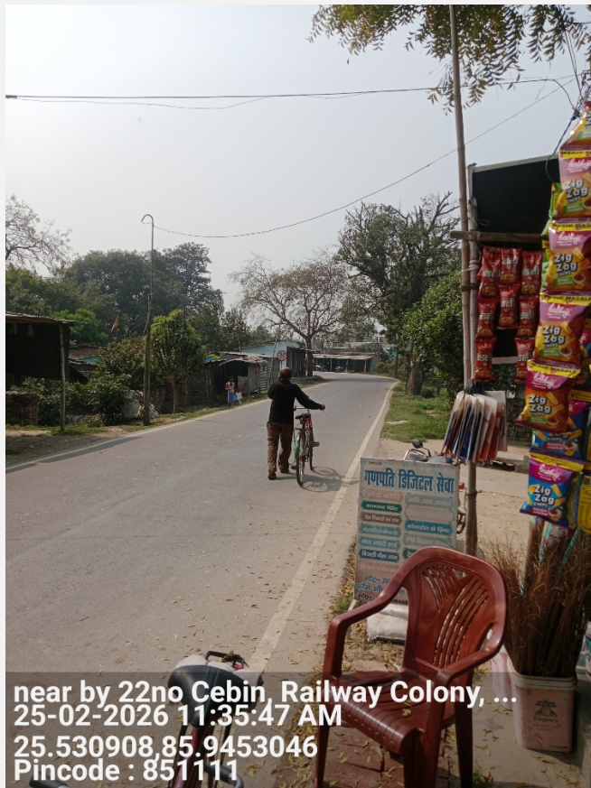
Photo of Outside Shop

near by 22no Cebin, Railway Colony, ... 25-02-2026 11:35:47 AM 25.530908,85.9453046 Pincode : 851111