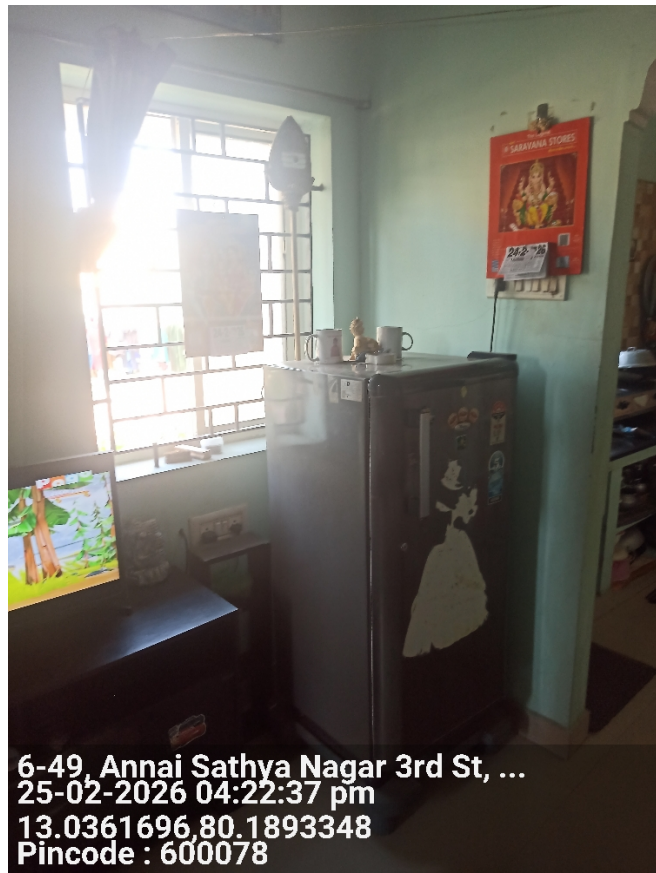
Photo with UPI Scanner