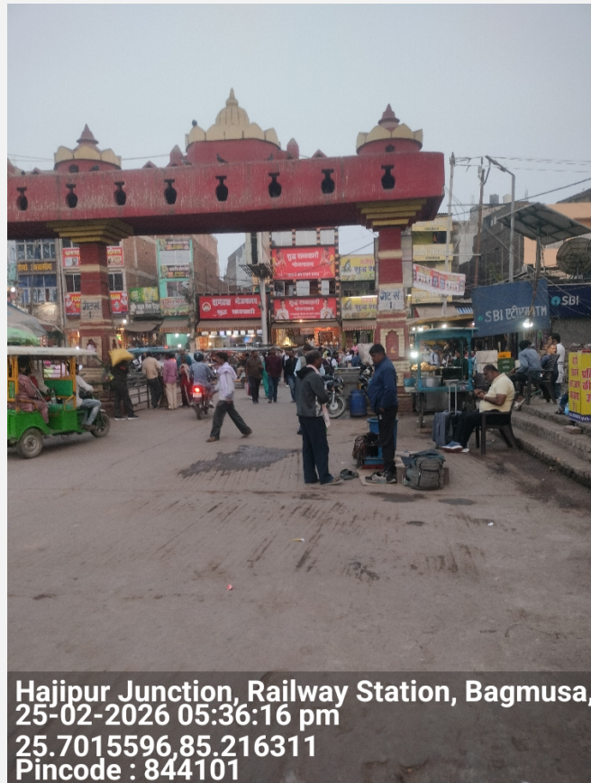
Hajipur Junction, Railway Station, Bagmusa, 25-02-2026 05:36:16 pm 25.7015596,85.216311 Pincode : 844101

Take Photo of Person Met Inside the Shop