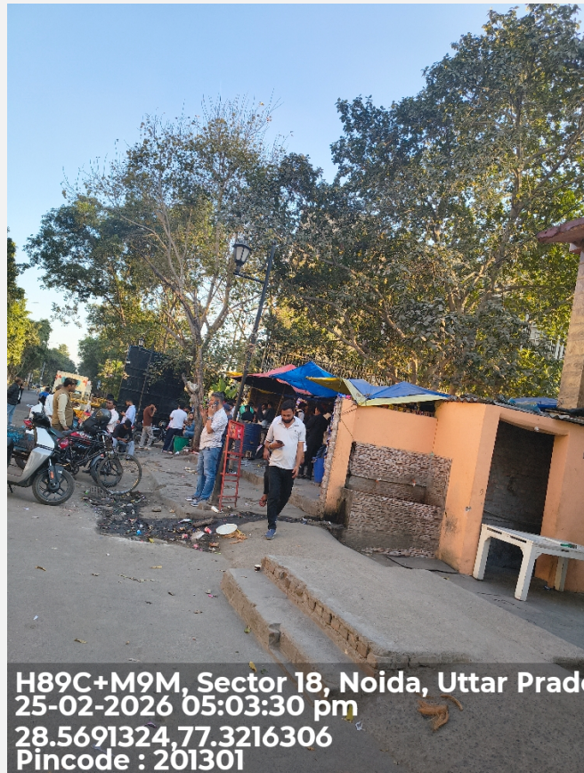
H89C+M9M, Sector 18, Noida, Uttar Pradesh 25-02-2026 05:03:30 pm 28.5691324,77.3216306 Pincode : 201301

Shop inside with inventory photos establishing that the inside is of the same shop where the front photo was taken