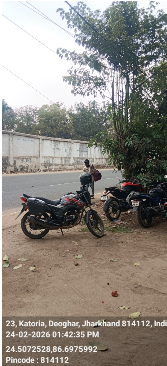
Photo of Machinery Setup