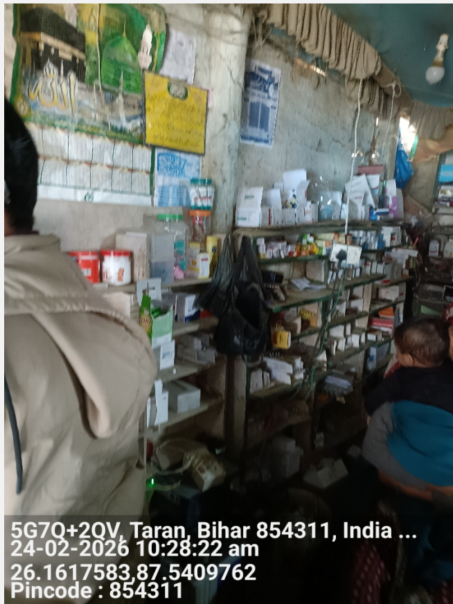
Photo of Stock