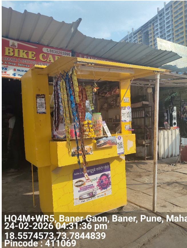
HQ4M+WR5, Baner Gaon, Baner, Pune, Maha 24-02-2026 04:31:36 pm 18.5574573,73.7844839 Pincode : 411069

Shop inside with inventory photos establishing that the inside is of the same shop where the front photo was taken