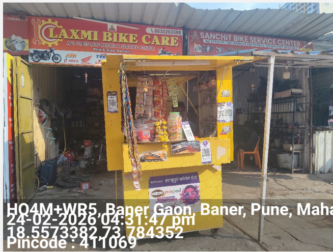
HQ4M+WR5, Baner Gaon, Baner, Pune, Maha 24-02-2026 04:31:47 pm 18.5573382,73.784352 Pincode : 411069

Shop front with horizontal view covering the left & right of the shop establishing if the shop is an individual structure, in a marketplace, highway, isolated place, in a cluster framework.