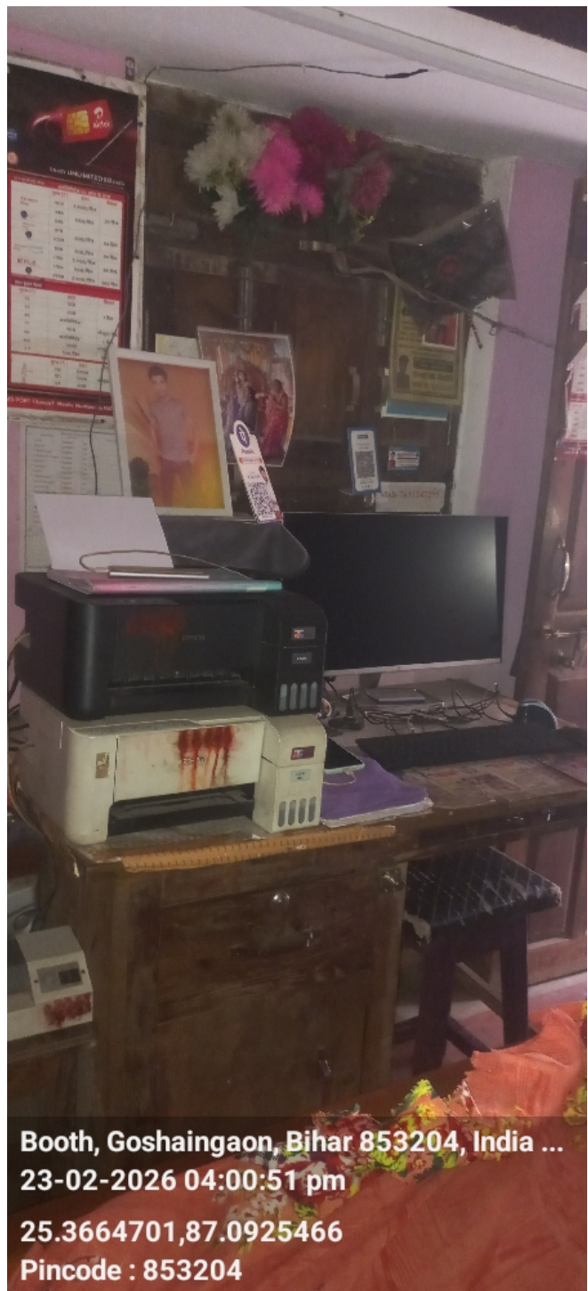
Photo of Machinery Setup