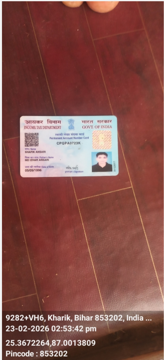
Photo of ID Proof