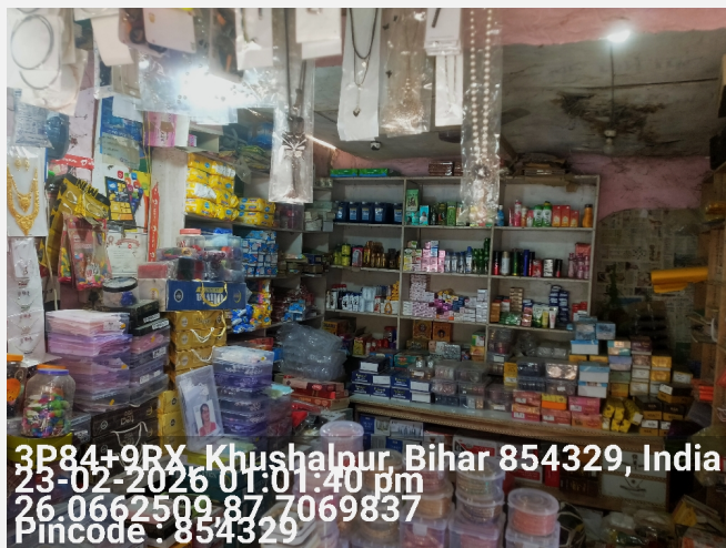
Photo of Stock