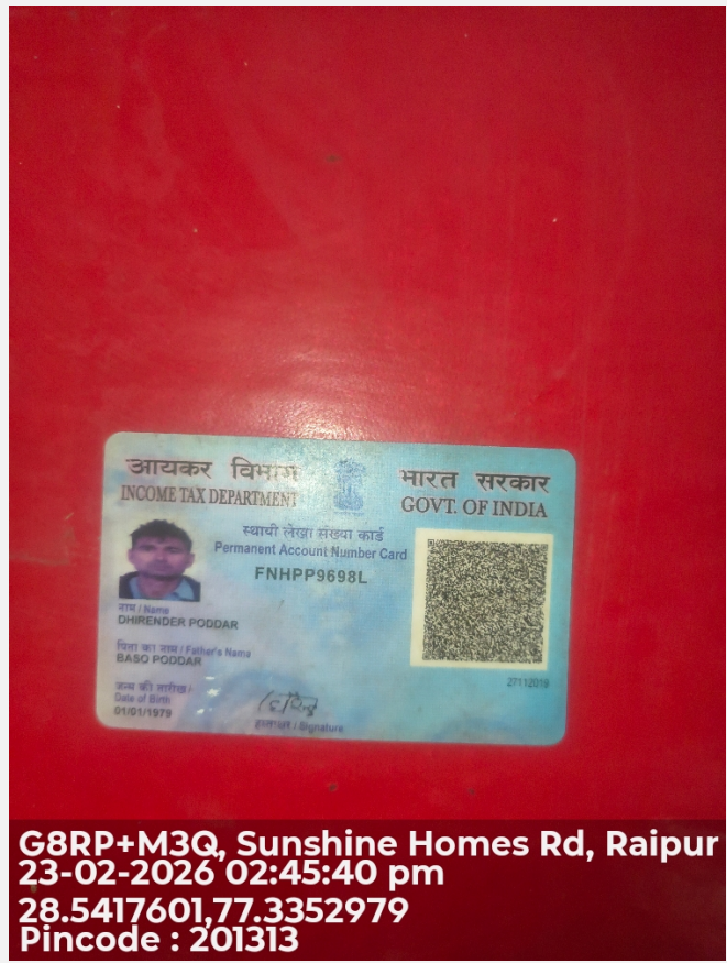
Photo of ID Proof