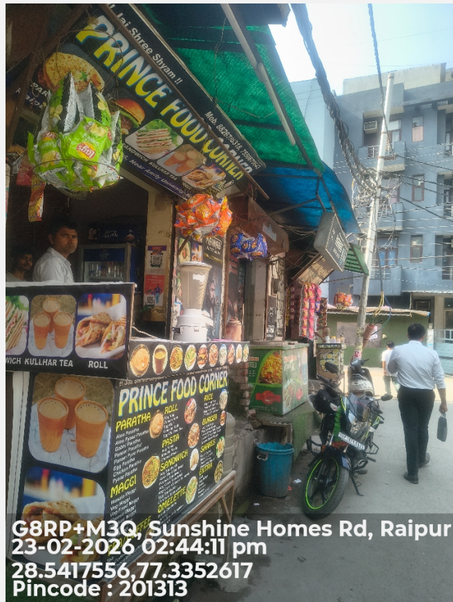
Photo of Outside Shop