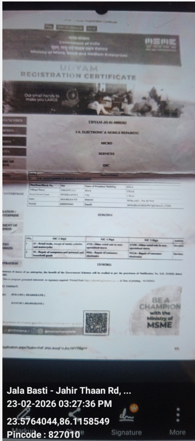
Photo of ID Proof