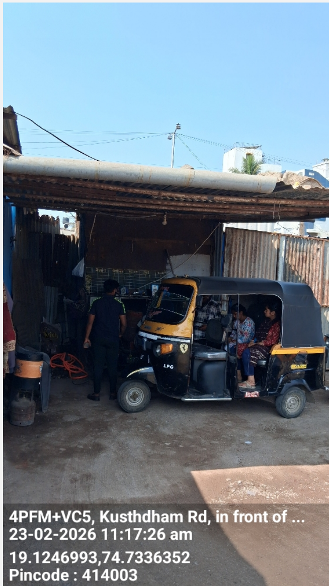
4PFM+VC5, Kusthdham Rd, in front of ... 23-02-2026 11:17:26 am 19.1246993,74.7336352 Pincode : 414003

Shop front with horizontal view covering the left & right of the shop establishing if the shop is an individual structure, in a marketplace, highway, isolated place, in a cluster framework.