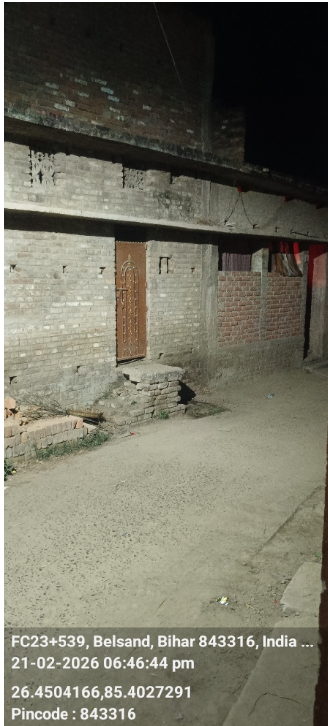
Photo with Agent