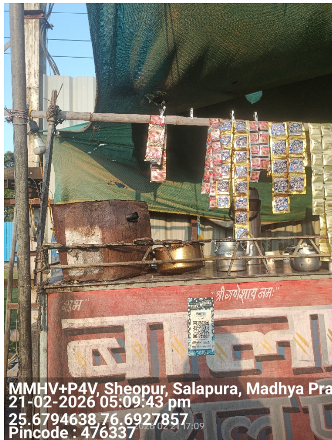
MMHV+P4V, Sheopur, Salapura, Madhya Pra 21-02-2026 05:09:43 pm 25.6794638, 76.6927857 Pincode : 476337

Shop inside with inventory photos establishing that the inside is of the same shop where the front photo was taken