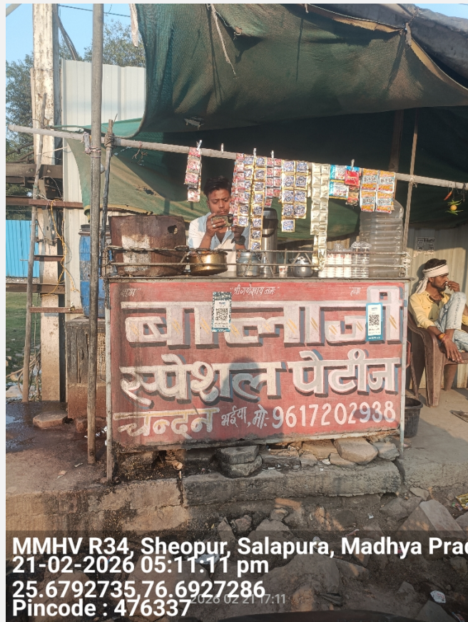
MMHV R34, Sheopur, Salapura, Madhya Pra 21-02-2026 05:11:11 pm 25.6792735, 76.6927286 Pincode : 476337

Shop front with horizontal view covering the left & right of the shop establishing if the shop is an individual structure, in a marketplace, highway, isolated place, in a cluster framework.